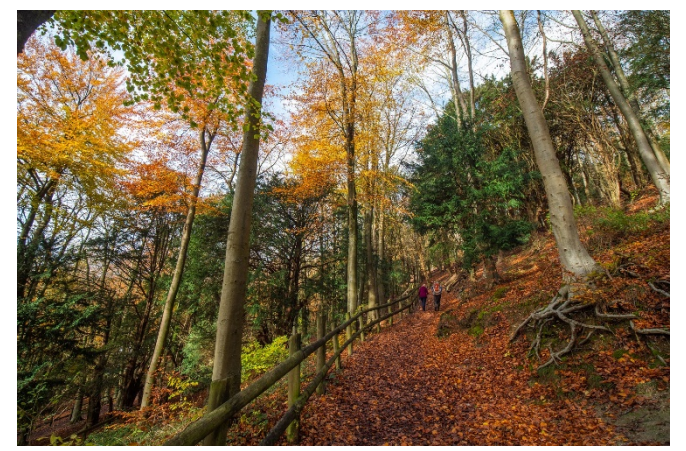
Queen Elizabeth Country Park in the autumn