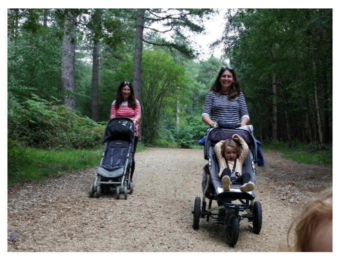
West Walk is perfect for families with buggies