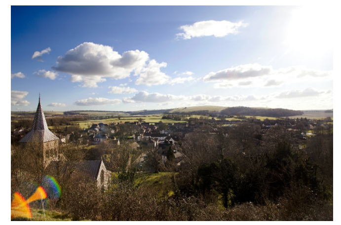
A view over the beautiful village of East Meon